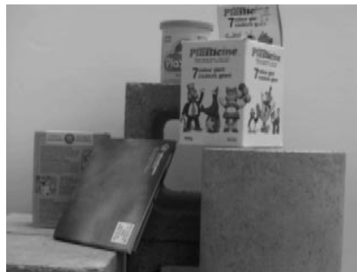
Figure 3: The test environment.