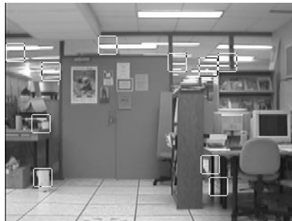
Figure 1: Detected Candidate Landmarks in an Image.

Luminance edges appear to encode much of the relevant geometric content in images, yet edge operators suffer from instability due to sensor noise or variations in lighting conditions. Ideally one might wish